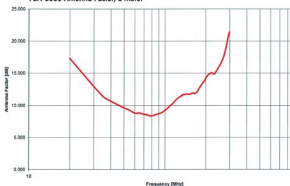
PBA-2030 Antenna Factor, 3 Meter